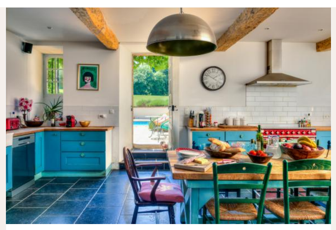
The Fosters' colourful kitchen